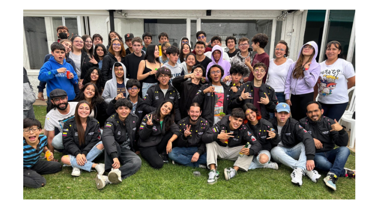
<u>Preludio</u> <u>School</u> <u>Bogota (Colombia)</u>