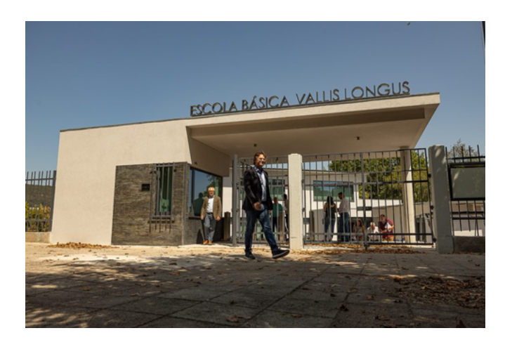
Basic School Vallis Longus Porto (Portugal)