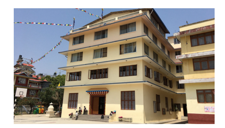
<u>Shree Mangal Dvip</u> <u>Boarding School</u> <u>Kathmandu (Nepal)</u>